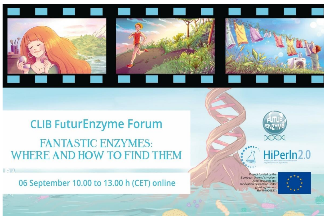
Fig. 1. Image created for the advertising of the webinar Fantastic enzymes: Where and How to find them.

This webinar corresponds to event number 1, inside the designation Series of 3 online webinars, "Enzymes for more environment-friendly consumer products", via online tools . It was organised by CLIB and CSIC with ITB's support, and took place on 6 September 2022.