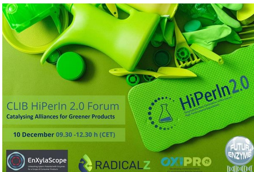
Fig. 3. Image created for the advertising of the CLIB Forum Catalysing Alliances for Greener Products.