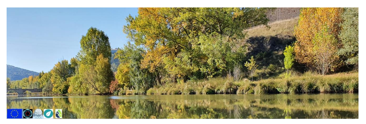
FNR-16-2020 Cluster "Enzymes for greener products"