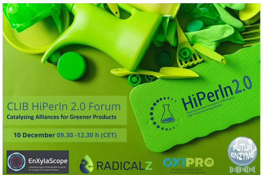
Fig. 3. Image created for the advertising of the CLIB Forum Catalysing Alliances for Greener Products.