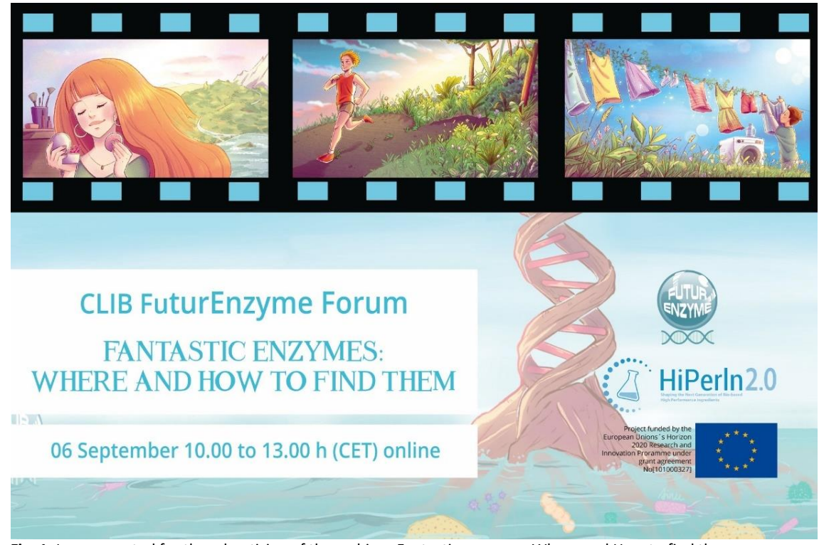
Fig. 1. Image created for the advertising of the webinar Fantastic enzymes: Where and How to find them.

This webinar corresponds to event number 1, inside the designation Series of 3 online webinars, "Enzymes for more environment-friendly consumer products", via online tools. It was organised by CLIB and CSIC with ITB's support, and took place on 6 September 2022.