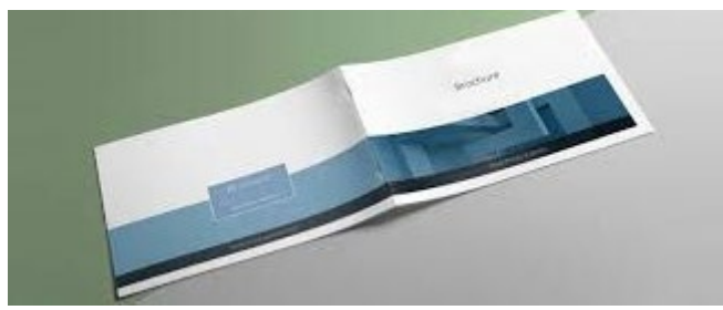
Figure 3. Brochures' format