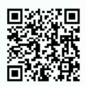
Figure 1. QR code to project website included in the last page of all project brochures

The last page includes all partners' logos, links, and QR code to the project website ( Figure 1 ). This page also repeats the FuturEnzyme logo and the EU flag as well as the disclaimer previously described.